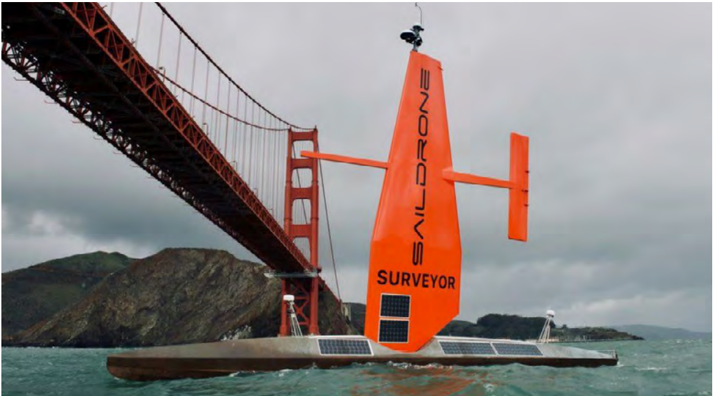
Saildrone Surveyor's cruise to Hawaii from San Francisco added 22,000 sq km of depth data