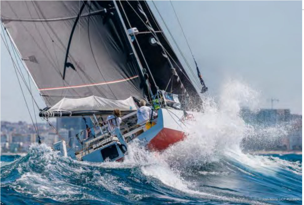
Brisk westerlies for Gryphon Solo II at the start of the Globe40 race in Tangier

The inaugural Globe40 Race got underway on Sunday, June 26, with seven Class 40 teams starting from the Moroccan city of Tangier on a 30,000-mile circumnavigation .